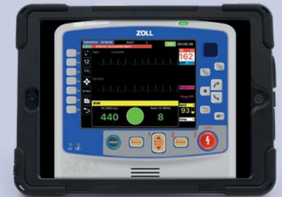
Training using SimConnect with any Manikin

Elevate Your REALITi 360 Experience: Intrigued by SimConnect's transformative potential? Get in touch with our team for a personal product demonstration.