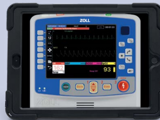
Training without SimConnect

Frontline Medical Training: Perfectly designed for first responders and paramedic training, emphasizing rapid medical intervention techniques.