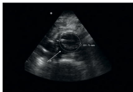
Calipers Measure and annotate your image