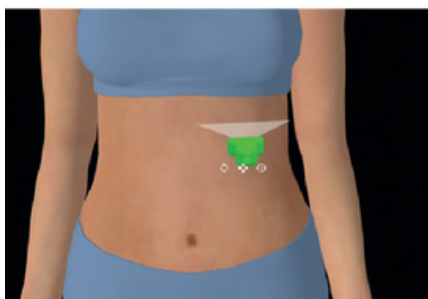
Probe control Learn how to get the right image with the digital probe