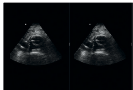
Immediate feedback Allow learners to compare their images with the Expert View